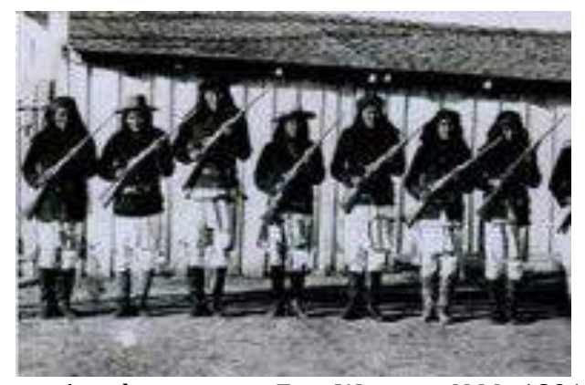
Apache scouts at Fort Wingate, N.M., 1891

Scouts furnished their own horses, guns, and ammunition, and received food rations for themselves, their families, and their horses as part of their pay. Most scouts were paid in goods, such as blankets or supplies, instead of cash. They did not receive government benefits unless authorized through treaties or individual acts of Congress. In 1842 several Cherokee warriors received federal pensions for their services during the War of 1812. It was not until 1858 that the heirs of Richard Farren, "a friendly Creek Indian" who also provided services during that war, were paid $600 for their loss. During the Civil War, Indian scouts served in segregated regiments on both sides along with Union and Confederate volunteer and Regular forces.